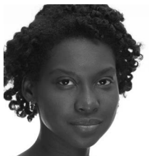
BLYSS CLEVELAND ACTOR