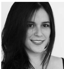
MARINA PITOMBEIRA ACTOR