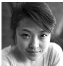
PEARL SHIN ACTOR