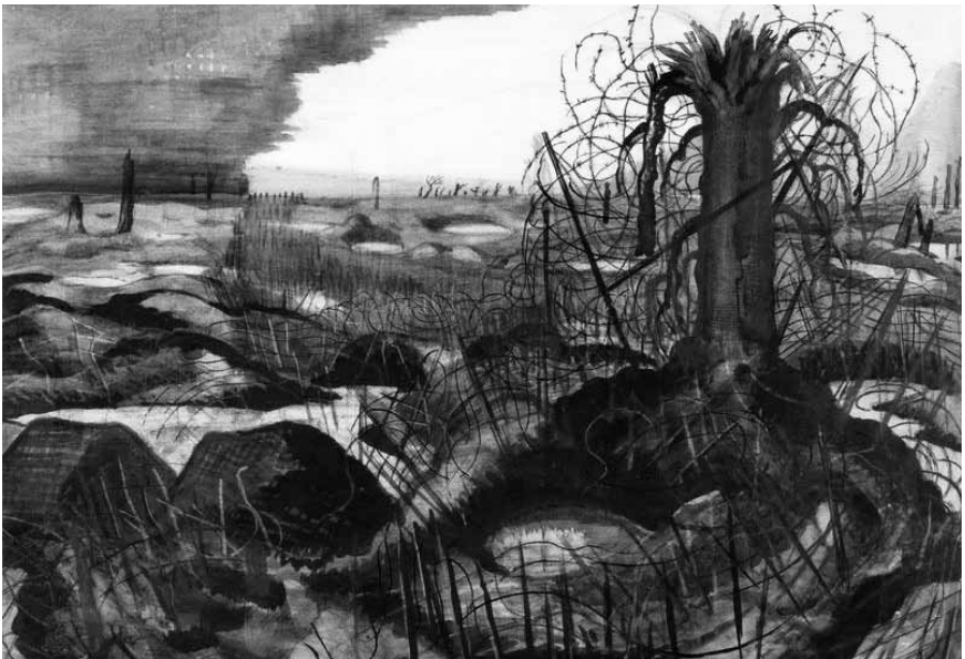
Paul Nash. Wire , 1918. Courtesy of The Imperial War Museum.