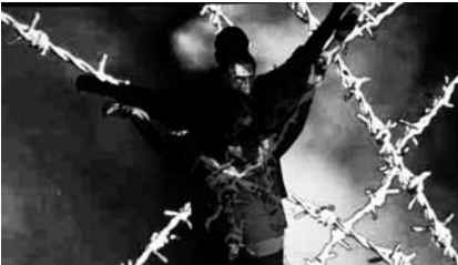
Rehearsal

Wedekind, Frank. Spring Awakening . English version and notes by Eric Bentley. New York: Applause Books, 1995.