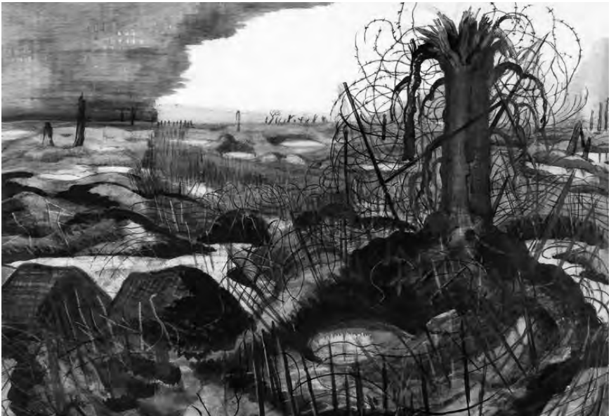
Paul Nash. Wire , 1918.