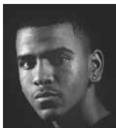
ELYAS HARRIS ACTOR