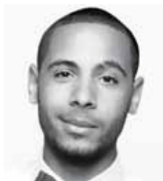
ALEXANDER CASTILLO-NUNEZ ACTOR